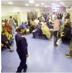
OUT PATIENT CLINIC S